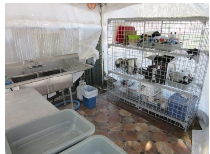
Food Prep Tent at The Grill

OTHER OPPORTUNITIES ( applications available at CAStateFair.org )