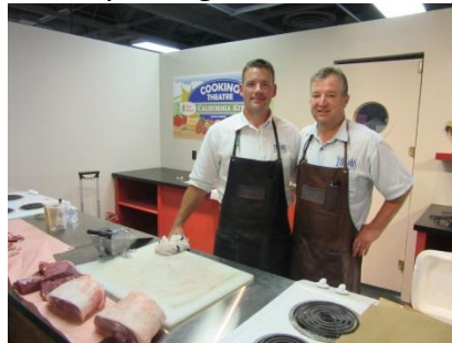
Whole Animal Butchering from Taylor's Market