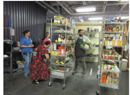
Ingredients & Supplies, Theatre Backstage