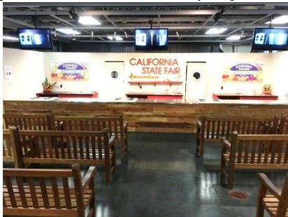
Cooking Theatre Stage

3-kitchen cooking-show-style set with seated audience, power and amplified sound. Electric Stove ( no gas stove is available, per fire code ). Pantry, refrigeration, wash station, and equipment are backstage.